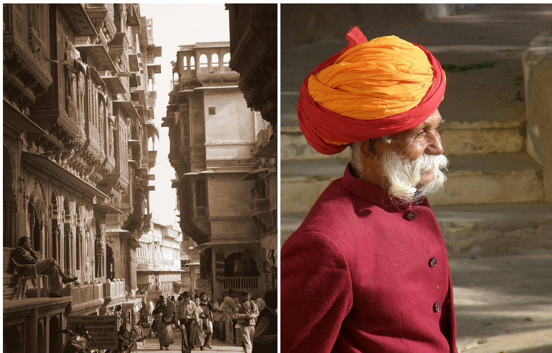
Jaisalmer Living Fort

The state is diagonally divided as the hilly and rugged south-east region and dry and barren north-east Thar Desert. Here, folk culture still retains all its colour and vivacity with exuberant celebrations of fairs and festivals. A music that echoes across the desert emptiness. Some of the popular fairs are Pushkar Camel and Cattle fair held annually in November, Camel Festival Bikaner held annually in January, Desert Festival Jaisalmer held annually between end January to mid February etc. The exact dates of the fairs is determined by the Indian Lunar Calendar.