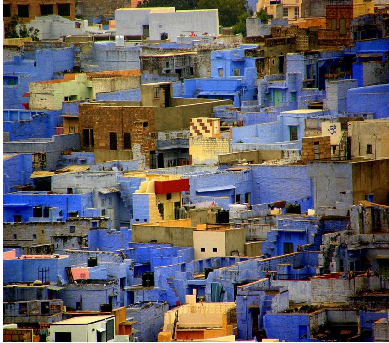
Blue City from Mehrangarh Fort

Day 8 Udaipur: Spend the rest of the day exploring this charming lake city by car. Wander through the opulent City Palace grounds and the museum, which are a testament to the valour and chivalry of the Mewar rulers. Visit the Jagdish temple on the shores of Lake Pichola. The breathtaking beauty of the lakes- Pichola & Fateh Sagar truly make Udaipur an oasis in the desert. Return to hotel after city drive. Dinner & overnight stay at the hotel. ON Udaipur.