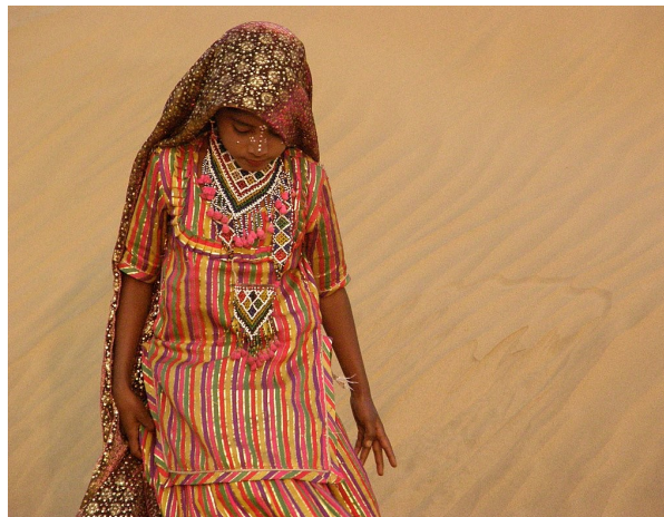
Jaisalmer Sand Dunes

Day 5 Jaisalmer: After breakfast, walk around Jaisalmer Fort, the monolith of stone, built in 1156 atop the 80 m high Trikuta hill, is the only raised feature in a flat desolate area. We will meander through alley ways lined with havelis sporting great intricate hand - carved sand stone latticed balconies and archways. After lunch around 1300 hour drive to the start point of our camel safari through the villages to sand dunes. ON Khuri.